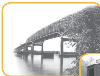
Betsy Ross Bridge

DELAWARE RIVER PORT AUTHORITY of Pennsylvania & New Jersey®