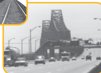
Commodore Barry Bridge