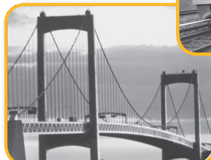
Walt Whitman Bridge