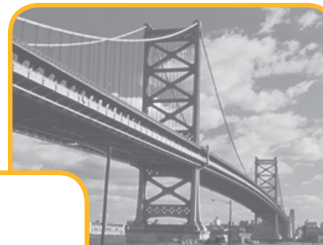
Ben Franklin Bridge