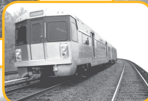
Port Authority Transit Corp.